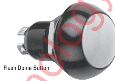
Flush Dome Button